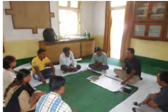
Practitioners set out the learning agenda

The first day of the FLE started with revisiting the concepts of filmmaking learned during the two previous workshop and listing out the areas in which the practitioners wanted more theoretical clarity and practice such as editing the film, addition of audio and photos, setting of the camera angle and the concept of scripting for the interview.